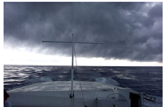
Left, it sure sounds like a lot of their time was spent eating! Here TSSC takes over the picnic tables near their condos. Top right, Bill Kilgallon smiles for the camera. Right, skies like this were an all-too-common sight that week.