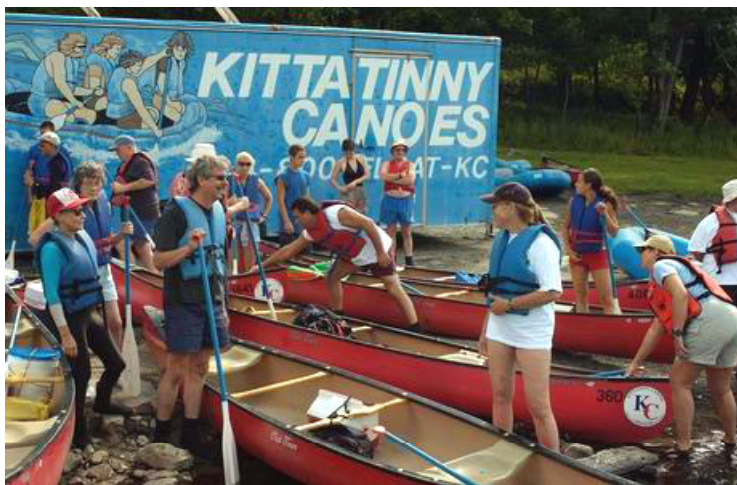
The TSSC armada prepares to embark on the Delaware River. Teens to grandparents enjoyed a picture-perfect day on the water.