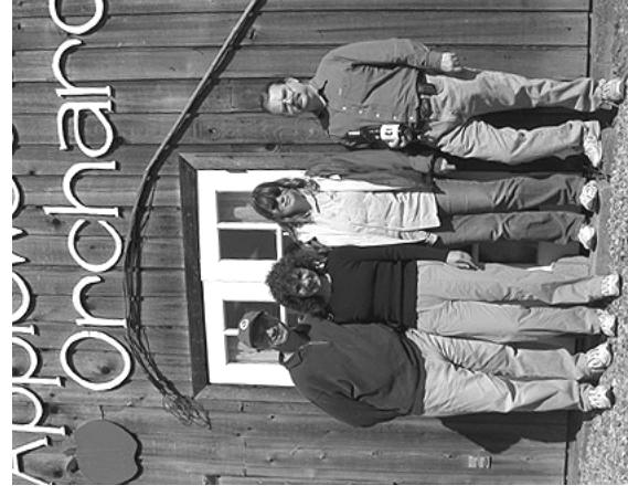
The Sea Swells Log • June 2003