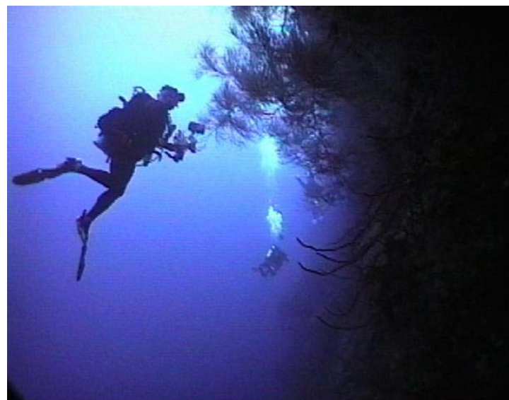
TSSC 2003 Diver of the Year Bob Schrage hovers along a wall off Little Cayman Island. Read all about this honor in next month's Sea Swells Log.